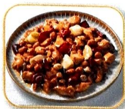
Kung Pao chicken