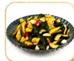
cucumber in sauce